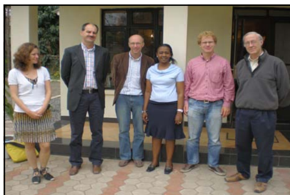
Members of the Dutch mission pose for a photo outside TAHA offices. Third from your right is TAHA's Executive Officer

This month TAHA was honoured by a visit by a group of researchers from the Wageningen University in the Netherlands. This is a team sponsored by the Ministry of Agriculture of the Netherlands, researching on the fresh vegetable and fresh fruit value chains of Tanzania, with particular focus on the institutions and institutional arrangements that prevail. This team has done many interviews and is now planning a workshop in Arusha to present the preliminary observations to various players in the industry before reporting the findings to the college. TAHA will be among the invited participants. In their TAHA visit the delegation was