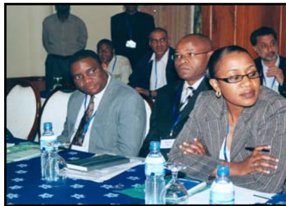
Some of the participants of the workshop listen keenly to one of the presentations. On your front right is the TAHA Executive Director.

ing the capacity of TASTA, a process champion on seed issues in Tanzania.